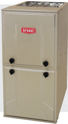
Model 916S and 912S