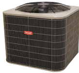
LEGACY AIR CONDITIONER

High-efficiency cooling power delivering whole-home comfort and energy savings.