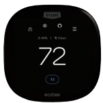
ecobee for Bryant Smart Thermostat

Achieve greater efficiency and whole-home comfort with this Wi-Fi® smart thermostat.